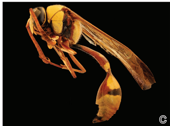
FIGURE 1. Vespids. A, The anatomy of a hornet. B, A brilliant image of a yellow jacket. C, A detailed image of a wasp.