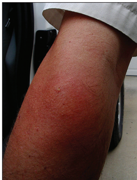
FIGURE 2. A large local reaction after a wasp sting.

If an individual has an SR, it is recommended to go to an emergency department after stabilization for monitoring. Referral to an allergist for desensitization is appropriate. A radioallergosorbent test to measure allergen-specific IgE can be helpful to confirm an allergy. 4 This test also should be done weeks after the incident because during the first few days IgE may be too low to measure. Once the allergy is confirmed, the desensitization with venom immunotherapy (VIT) can begin. Venom immunotherapy is effective and reduces a patient's risk for recurrent SRs to less than 5% to 20%. 6 A 2015 study recommended longer duration of VIT therapy due to risk for repeat SRs after discontinuing therapy. This study concluded that VIT is to be administered for 5 years, unless the patient is at high risk for SRs after VIT therapy—risk factors include older age, cardiopulmonary disease, SR during VIT treatment, mast cell disorders, and elevated serum tryptase—in which case VIT may have to be continued indefinitely. It is recommended that all patients